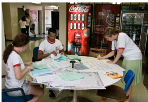
Counselors hard at work.

Even though the Program might not reach as many people as other state-funded institutions, it is very important to those who attend. It changes lives, molds people. It not only grows minds but also whole people. The Program is crucial and needs to be preserved.